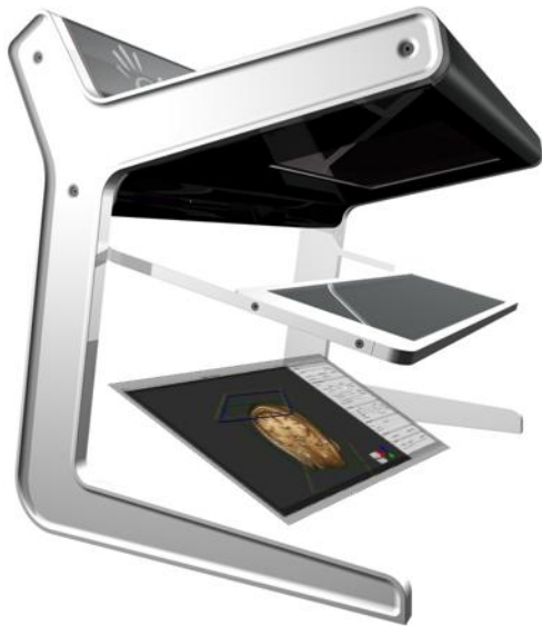
Personal Space Station (PSS)